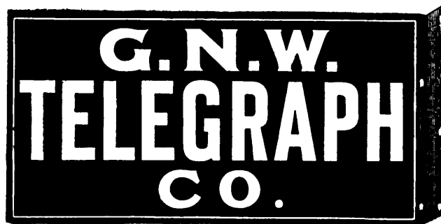
No. 3.—Double, 21½ x 10 ins., including flange, white letters on blue ground.