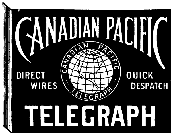
No. 1.—Double, 19 x 13 ins., including flange, white letters on blue ground.

The only signs that are absolutely impervious to the weather.