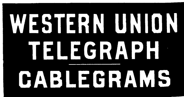
No. 5.—Single, 24 x 12 ins., white letters on blue ground.

Enamel Iron Signs can be made in any shape, size or colors. Blue and white make the most striking contrast.