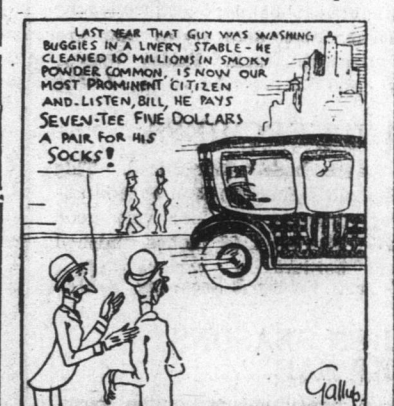
As a Rule Success is Measured in Money.

Success is a process which consists in climbing to the top of the ladder and sitting tight. Some men are born successful at a tender age and are able to demote their playmates of marbles and jack-knives with monotonous regularity. Others achieve success by working sixteen hours a day while their companions are trying to keep step with a five-piece dance orchestra. And a large number have success thrust upon them by the unexpected demise of a rich relative who intended to leave his money in another spot.