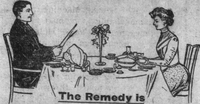
The Remedy is

Does Your Food Distress You After Eating? WOULDN'T YOU LIKE TO FEEL "GOOD AND HUNGRY" every time you sit down to your meals? That's the way one should feel, but you never can unless your digestion is perfect.