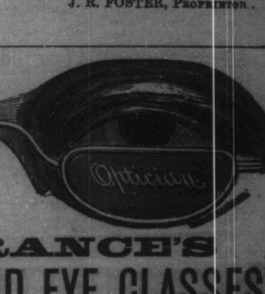
B. LAURANCE'S SPECTACLES AND EYE GLASSES are the only genuine English articles in the Canadian market. Scientifically cut from the purest material, and adapted to the purpose, they are without exception the best adapted to restore the vision of age and to insure perfect vision. They are recommended by the President, Ex-President, Vice-President and Ex-Vice-Presidents of the Medical Association of Canada. B. Laurance's Spectacles which blind the eye and get properly fitted by one of B. Laurance's Agents who are without exception provided with the proper Optical Instruments for correctly gauging the sight.