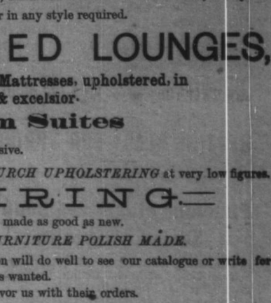
PARLOR SUITES, LOUNGES, BED LOUNGES, Students' Easy Chairs and Mattresses, upholstered in hair, wool & excelsior. Bedroom Suites of all kinds from the cheapest to the most expensive. We are also prepared to do all kinds of CHURCH UPHOLSTERING at very low figures. REPAIRING. Old Furniture Rep-upholstered and polished, and made as good as new. We have for sale the best FURNITURE POLISH MADE. Parties needing Furniture of any description will do well to see our catalogue or write for particulars, describing as near as possible what is wanted. We guarantee satisfaction to all who may favor us with their orders.