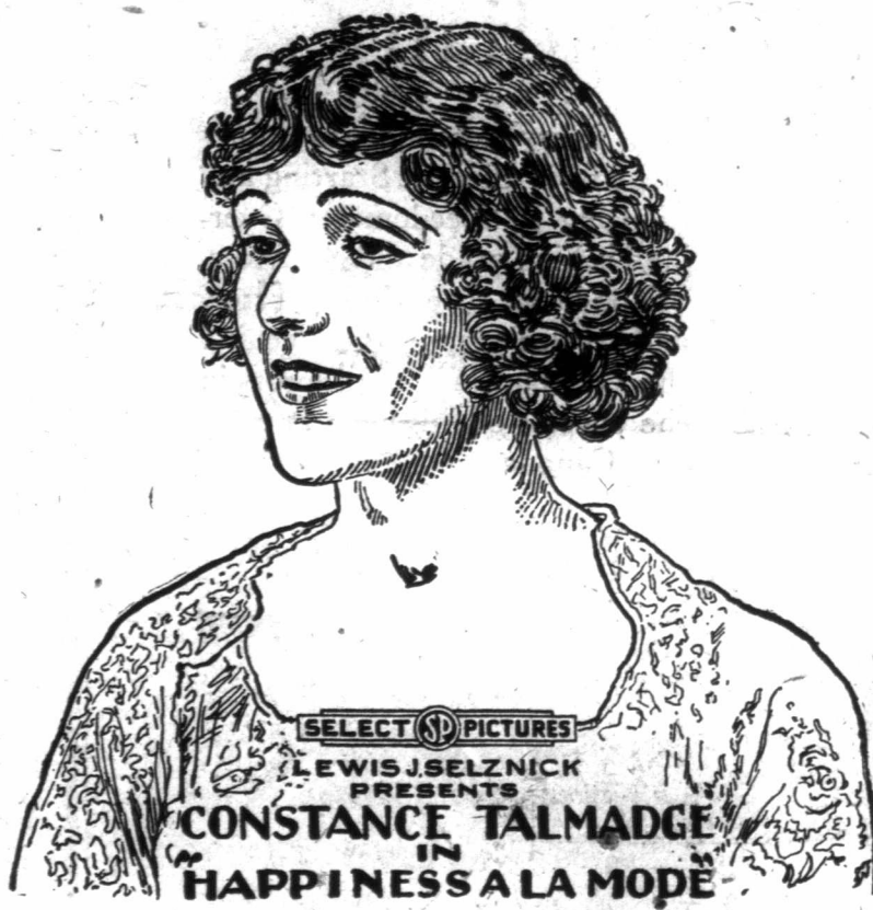
SELECT PICTURES LEWIS J. SELZNICK PRESENTS CONSTANCE TALMADGE IN "HAPPINESS A LA MODE"