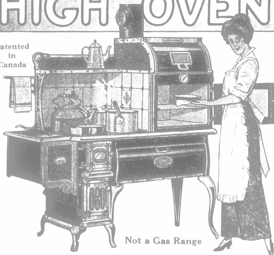
Not a Gas Range

MOTHER too often sits down to the meal she has prepared too tired to enjoy it. Happy—but oh, so weary!