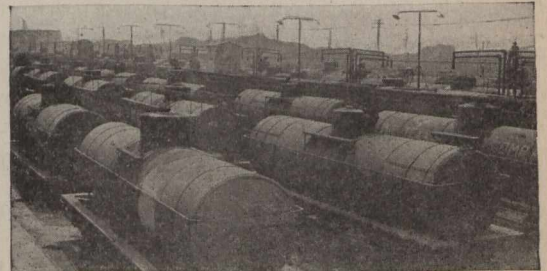
“Imperial Asphalts can be quickly delivered to any part of the Dominion. They come in tank cars or packages, whichever is best suited to your requirements.”

“There are three Imperial Asphalts for road purposes, Imperial Paving Asphalt for preparing Hot-Mix Asphalt (Sheet Asphalt, Bitulithic, Warrenite, or Asphaltic Concrete), Imperial Asphalt Binders for Penetration Asphalt Macadam and Imperial Liquid Asphalts for dust prevention and for increasing the traffic-carrying capacity of earth, gravel and macadam roads.”