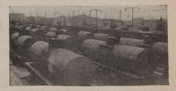
"Imperial Asphalts can be quickly delivered to any part of the Dominion. They come in tank cars or packages, whichever is best suited to your requirements."

"There are three Imperial Asphalts for road purposes, Imperial Paving Asphalt for preparing Hot-Mix Asphalt (Sheet Asphalt, Bitulithic, Warrenite, or Asphaltic Concrete), Imperial Asphalt Binders for Penetration Asphalt Macadam and Imperial Liquid Asphalts for dust prevention and for increasing the traffic-carrying capacity of earth, gravel and macadam roads."