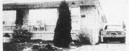
TRY YOUR OFFER

$3,000 down. Asking $37,500, full price. Lovely 2 bedroom detached bungalow in Royal York & Queensway area. Fireplace, broomloom thruout. Carries for under $300.00 monthly. View with Arnie Ross 255-9111.