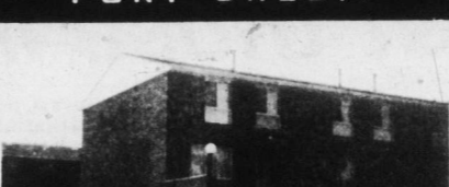
BEST BUY OF THE WEEK

$45,500. Best buy in Clarkson, end unit, 3 bedroom, 2 storey townhouse with finished Recreation Room in the full basement, $5,000 down payment. Call John Cassan 278-9445 evenings 278-6525.