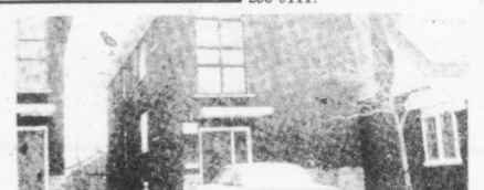
TRY A 3-PLEX

$44,900. Ideal starter home. Neat 2-bedroom bungalow. Solid brick. Situated only steps to TTC and shopping. Newly decorated, good sized back yard. Low down payment. Call Mr. Krush at 255-9111.