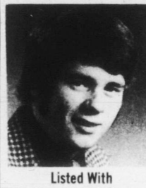
Listed With Ted Latham

Any other ad until you call Ted Latham and ask about the 3 bedroom, solid brick detached home in west end. Full price $37,900.00. Features private paved drive and 2 car garage. Inside has fireplace in living room, separate dining room, all hardwood floors and full basement. Call 279-5600 and ask for Ted.