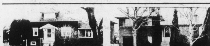
LOVE A BARGAIN

I.C.I., Industrial, Commercial Leasing, Commercial Development, Investment, Land