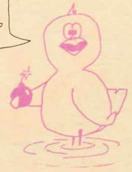
A little bird about to be blown apart... Sept 17, 1970

Controlled as it is by the ruling class of society, this university serves their needs (at the expense of the needs of the people) and as such is an instrument of oppression. What could be more obvious?