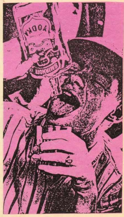
Plus ça change, plus c'est la meme chose...