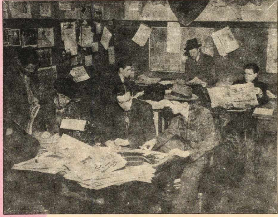
Fun times and funnier hats in the Gazette newsroom...