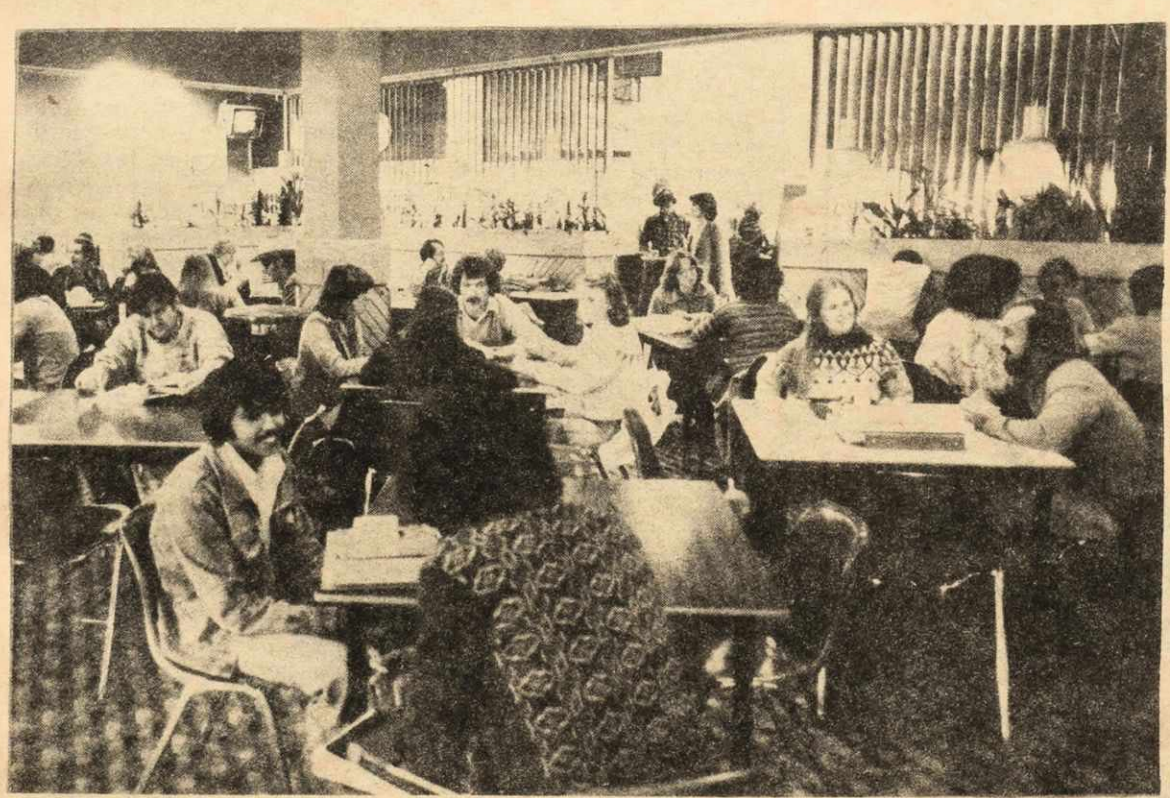
Dal Photo Patrick