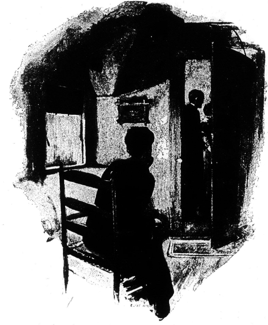
"A firm footfall caused the little woman to slip the bandage from her eyes and look up.'

morning "I think I shall creep over before the church is closed and look at them and smell them and touch them.