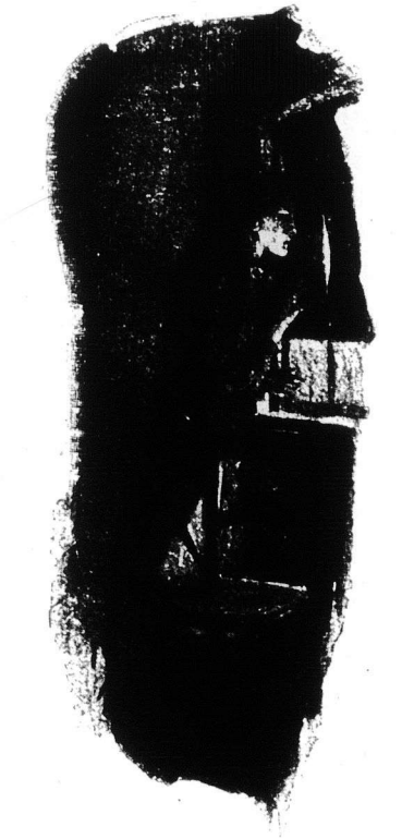
"Watching him with fascinated eyes as he walked to church."

She had grown stronger after time, and in the darkness prayed blindly for light and for knowledge of what she ought to do. What she