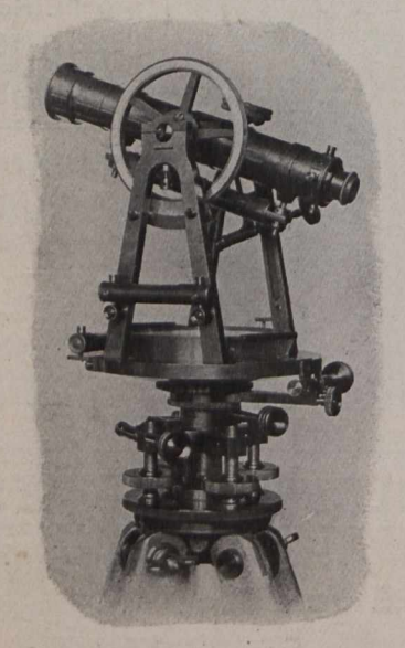
Consol "5" Transit $190.00.