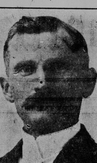
Havelock, Ont., Conservative candidate for the Commons in East Peterborough.