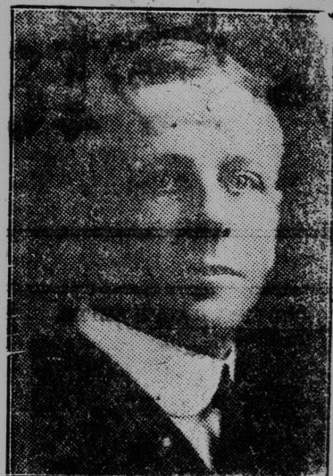
Elected president of the Association of Canadian Advertisers.