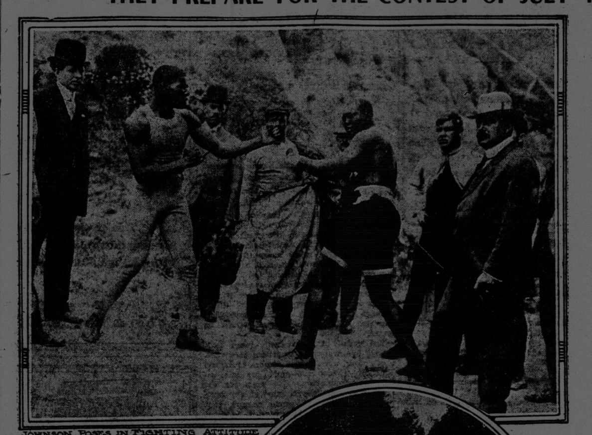
JOHNSON FIGHTS IN FIGHTING ATTITUDE. LITTLE AND MAN HE WANTS WHIP LOOKING ON.