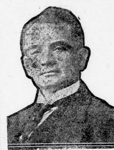
The Clothing King