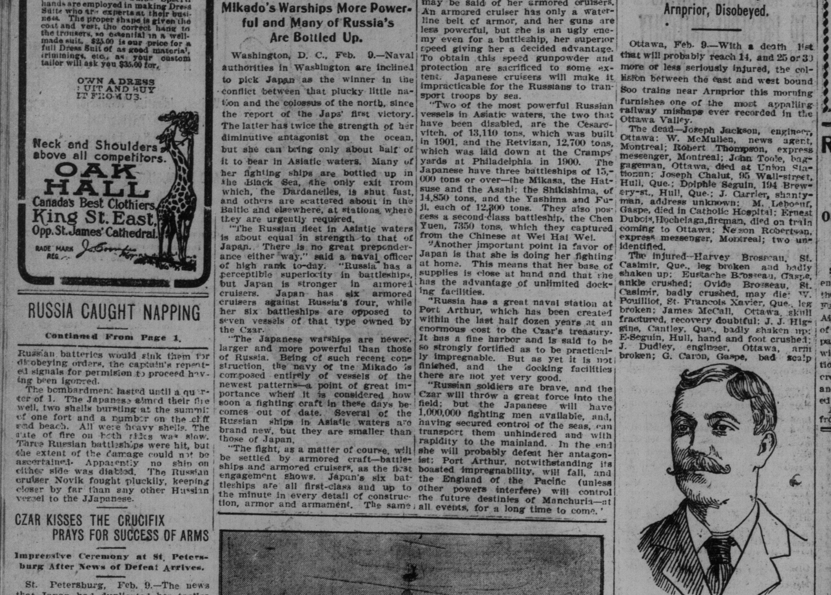
TORONTO MAN KILLED.

Siding at Sand Point, Near Arnprior, Disobeyed.