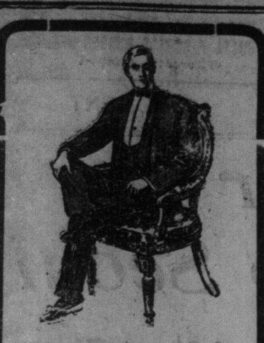
Full Dress Suits