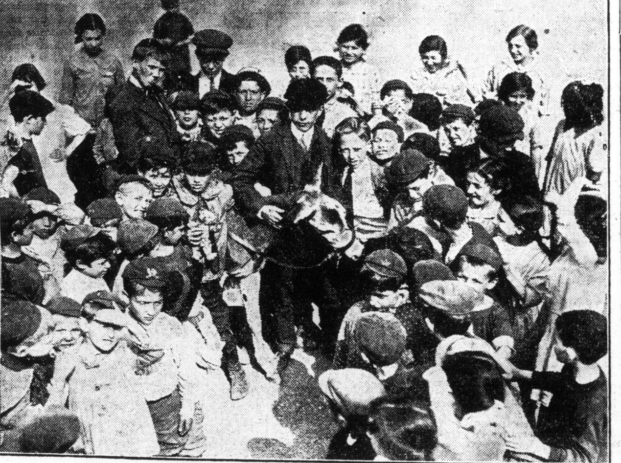
The Italian and Jewish children pronounce El Paso Jack, with his cunning, affectionate ways, the finest playmate that they have had yet.

"THE PLEASANT LAGER WITH NO UNPLEASANT BITTER"