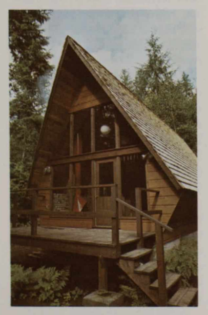
The Nookta 35T

cedar shake shingles. Because of the variations in building codes, no Nor-Wes package includes sheet glass, finished floors, heating, plumbing or electrical supplies.