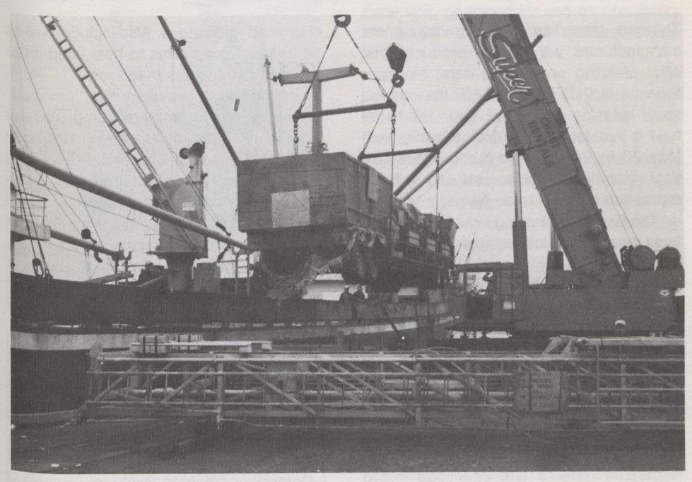
A Cardwell oil rig is loaded aboard for transport to India.

Cardwell Manufacturing Limited of Edmonton, Alberta exported $7 million worth of oil rigs to India in 1984, bringing its total sales to the country over the past three years to $16 million. These 1984 exports were in addition to domestic sales of $3 million.