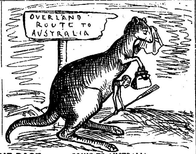
GOING TO AUSTRALIA.