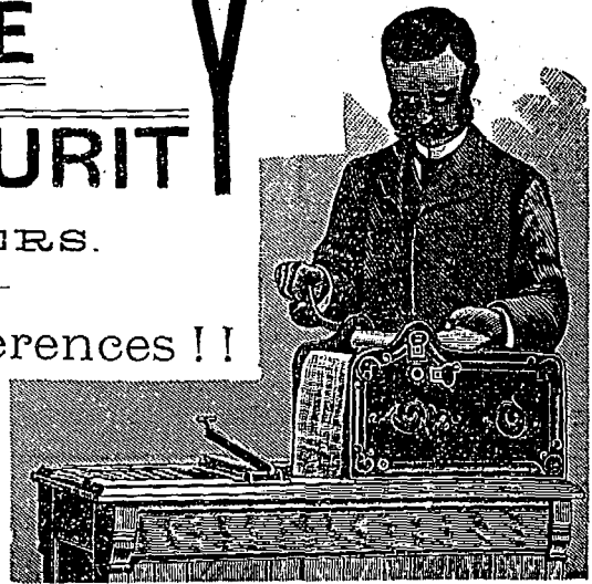
RAPID ROLLER DAMP-LEAF COPIER.

The SHANNON CABINET and RAPID ROLLER COPIER in use, afford the most perfect system for filing together Letters and Copies of answers to same.