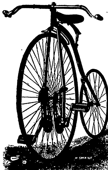
THE PERFECT SAFETY.

Editor of "C. T. C. Gazette" says it is the "best of the whole bunch." It is the original machine, and the vital parts are patented, and all copies of it are wanting in one important particular. Price, $105.00: Ball Pedals, $5.00 extra.