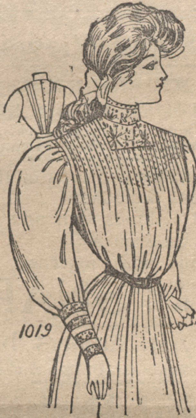
MISSES' TUCKED OR GATHERED SHIRT WAIST—1019.

This pretty design would make up nicely in any soft material. The waist closes at the back and may be made with or without tucker, which is of all-over lace. It is tucked to form a pointed yoke effect, which gives it a pretty blouse. The sleeves are made with deep cuffs, trimmed with bands of insertion or all-over lace. The pattern is cut in four sizes, 13 to 16 years. For 16 years it requires 2 5-8 yds. of material 27 inches wide with a 1-2-yard of all over 18 inches wide for tucker.