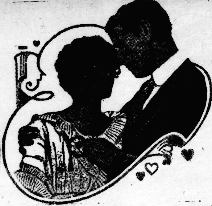
A scene from Lois Weber's "To Please One Woman," a Paramount picture, showing at the Allen on Monday, Tuesday and Wednesday of next week.

MONDAY, TUESDAY AND WEDNESDAY—Mae Murray in "The Gilded Lily"; Charlie Chaplin in "A Night in the Show"; Loew's British