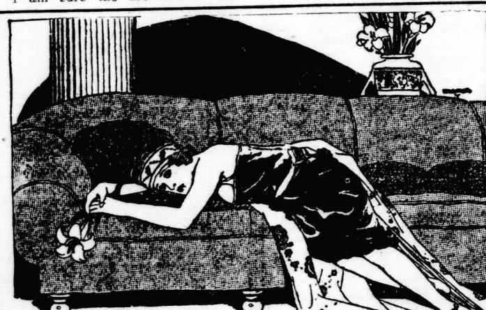
Mae Murray will appear as "The Gilded Lily" at Loew's on Monday, Tuesday and Wednesday.

At Loew's on Thursday, Friday and Saturday.