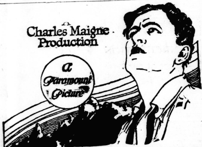
Thomas Meighan in "The Frontier of the Stars," showing at the Allen Thursday, Friday and Saturday of next week.