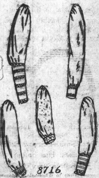
8716 A Group of Practical Models. Set of Sleeves.

A pattern of this illustration mailed to any address on receipt of 10c. in stamps or silver.