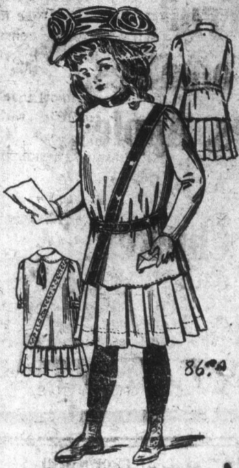
8690 Girls Russian Blouse Suit. Simplicity and Comfort Combined.

The Home Dressmaker should keep a Catalogue Scrap Book of our Pattern Cuts. These will be found very useful to refer to from time to time.