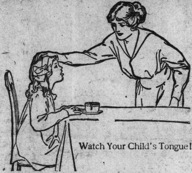
Watch Your Child's Tongue!