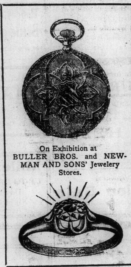
On Exhibition at BULLER BROS. and NEWMAN AND SONS' Jewellery Stores.

The contest is fast nearing an end. Are the judges going to read your name as a winner of the Grand Prize Dodge Bros. Touring Car, or are you going to be contented as a winner of some small prize? Results will tell. Success will crown your effort. The slogan this week, "Get Busy." Keep busy and get results. Success and failure both have the same number of letters. Which is to be yours?