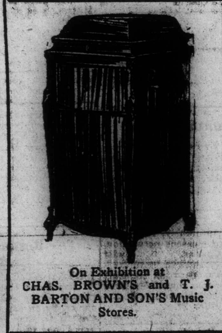
On Exhibition at CHAS. BROWN'S and T. J. BARTON AND SON'S Music Stores.