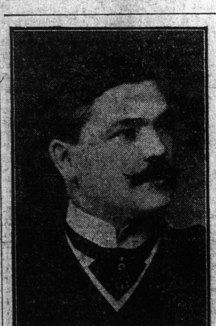
HON, RODOLPHE LEMIEUX.

OTTAWA, Oct. 2.—It is probable that Canadian government to discuss immigration questions with Japan. Consul General Nosse will be his companion on