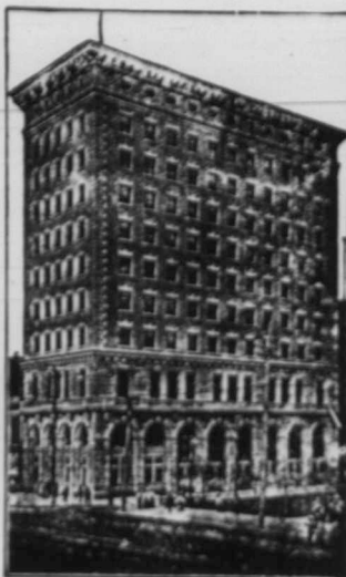
Union Bank Building, Winnipeg