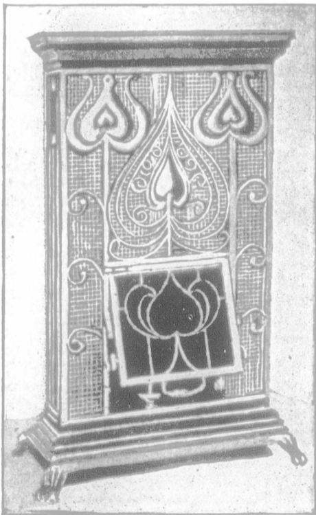
C 8. Inclusive Price, £12 12 C.