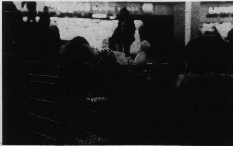
Sale upon sale. Youth gets close up view of bargains during one of several Boxing Day sales at Sheridan Mall.

Bundling Christmas doll into supermarket buggy, young play mother goes searching for values. Thousands of bargain hunters swamped Mississauga malls and plazas looking for savings.