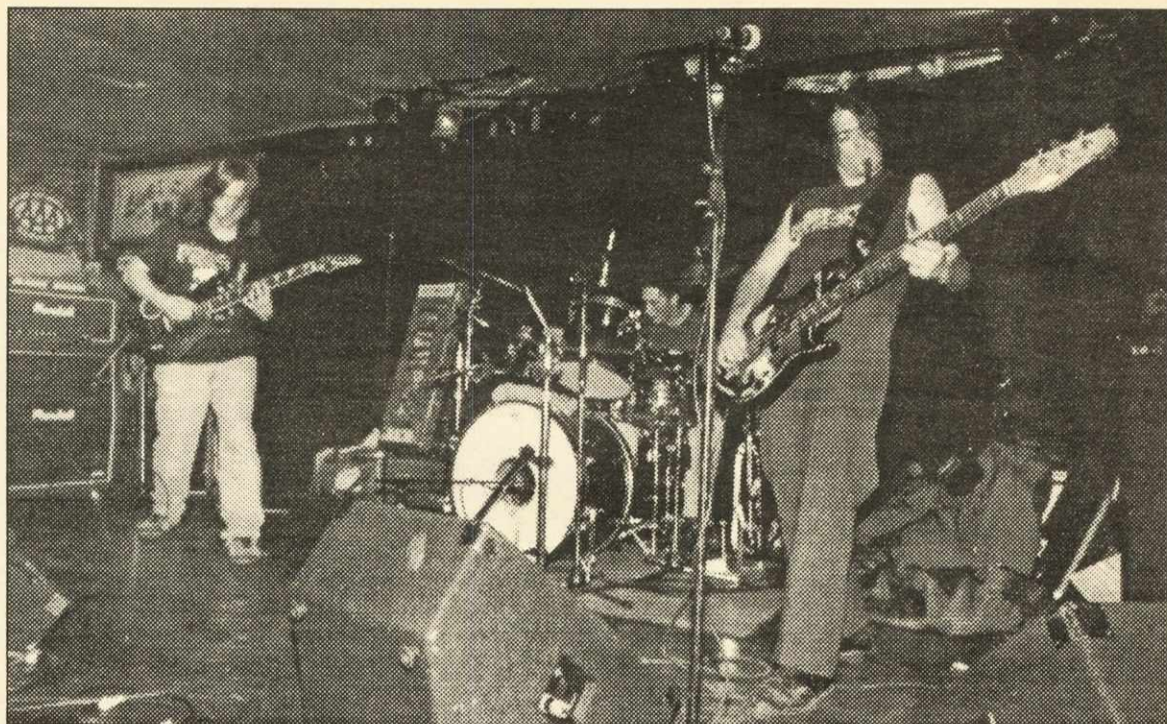
Spine kicks out the jams — while sober and clothed!

As for SOL's music, it was instantly forgettable, so I don't have much to say about it except that it was boring. Regurgitated, lame metal just doesn't impress. Maybe I'm still bitter that I had to walk home. Probably not.