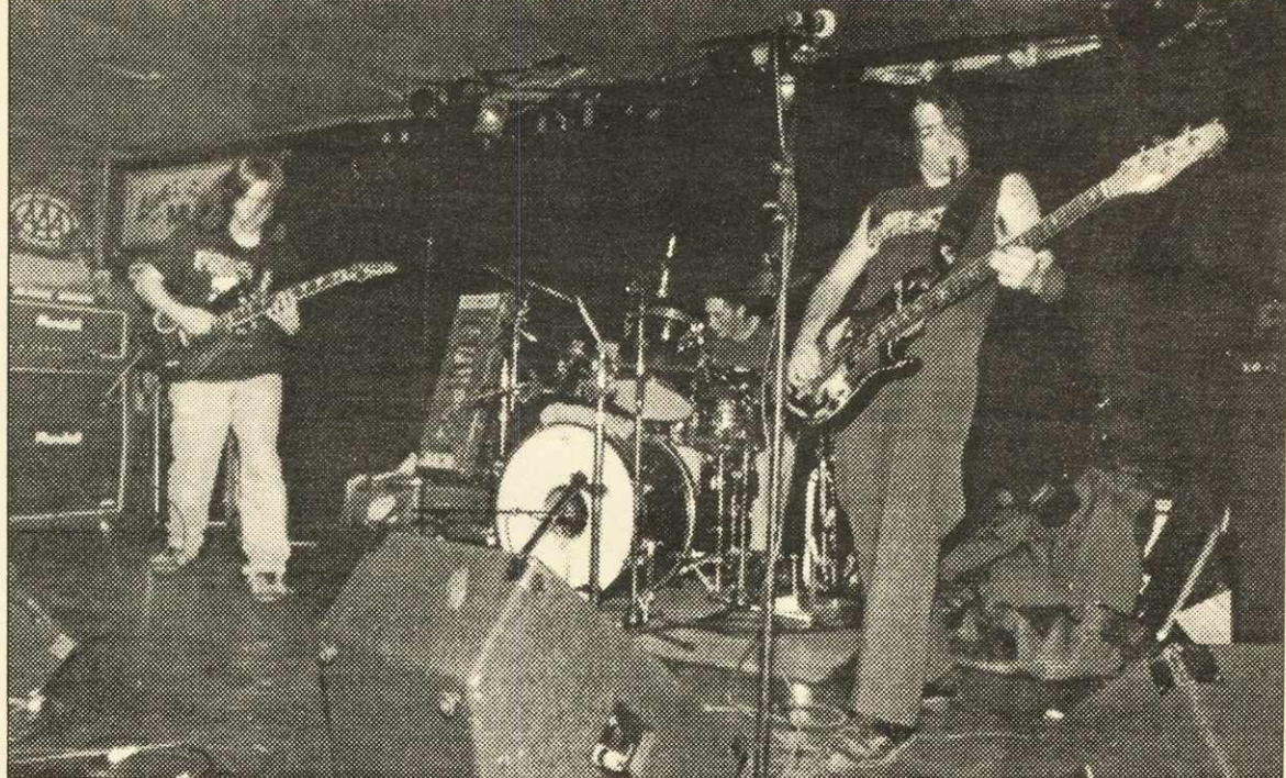
Spine kicks out the jams - while sober and clothed!

As for SOL's music, it was instantly forgettable, so I don't have much to say about it except that it was boring. Regurgitated, lame metal just doesn't impress. Maybe I'm still bitter that I had to walk home. Probably not.