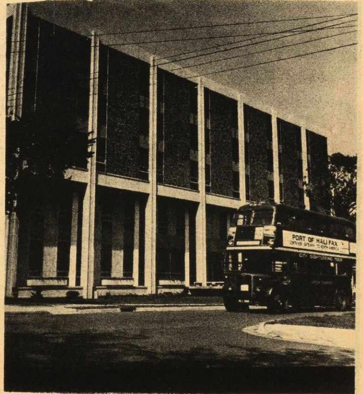
Weldon Law Building Faculty of Law office, Directory of Studies, Admission (Law) office, Sir James Dunn Law Library, Student Lounges