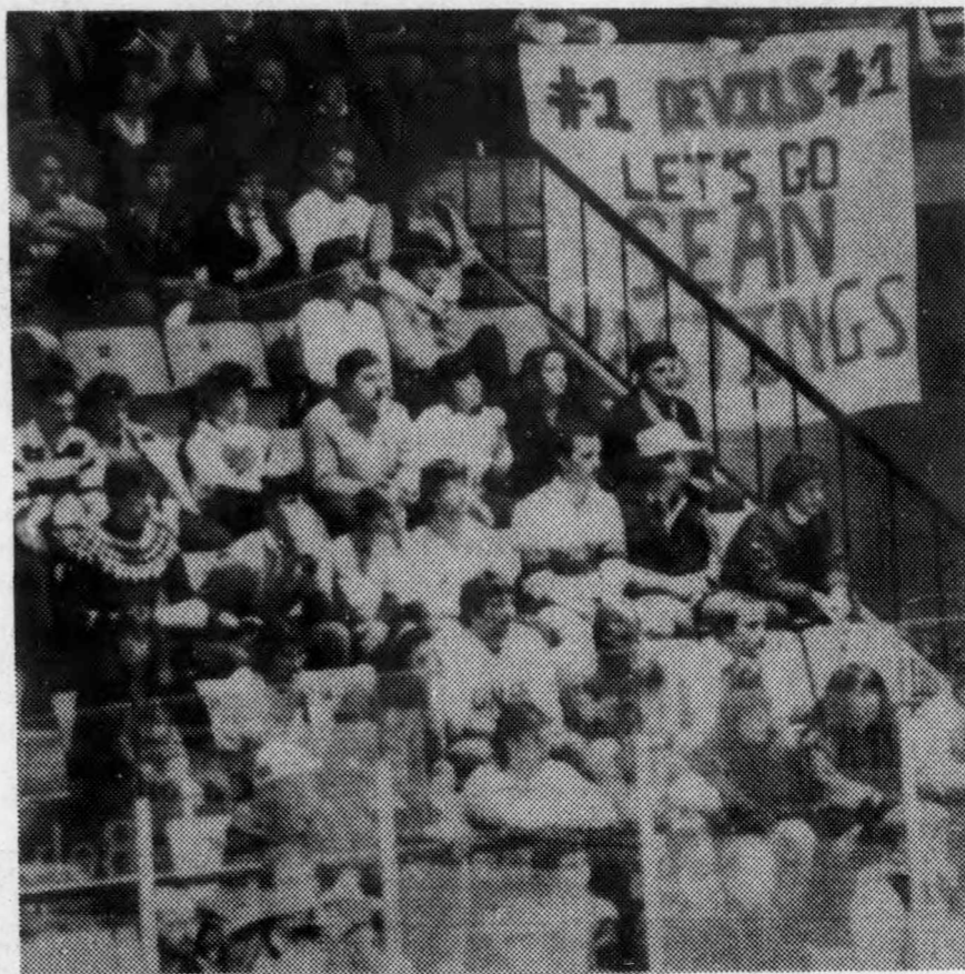
Red Devils were out in droves for both games against the U of T Blues.

The season may be over for the UNB Red Devils, but the memories of the past two weeks will be in the minds of many people for a long time.