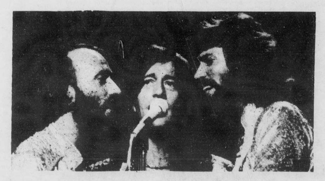
The Gee Bees singing their golden oldies