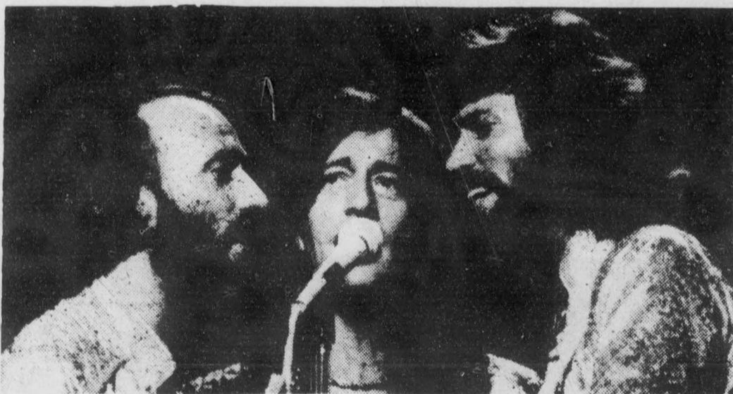
The Gee Bees singing their golden oldies