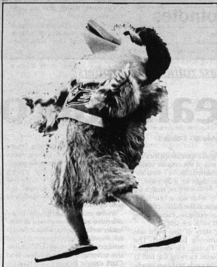
Waiting for a delivery of your entries from the stork, The Chicken looks up to the sky, so keep them coming and be the one to win 2 tickets to see him.

All spectators are welcome to attend. There will be a collection plate at the door as all proceeds from Anchor Splash will be donated to the CNIB. Prizes provided by local businesses will be awarded for the various events.