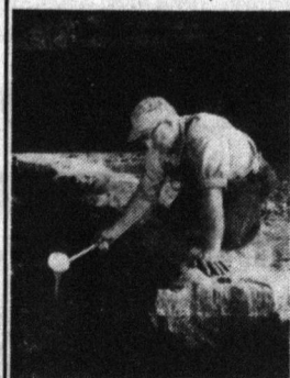
Our own iron-free water

AT THE JACK DANIEL DISTILLERY, we have everything we need to make our whiskey uncommonly smooth.