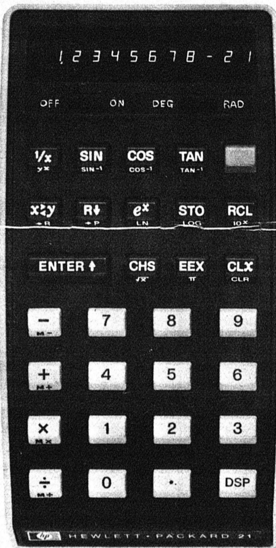
The Hewlett-Packard HP-21 Scientific $159.00

The calculations you face require no less.