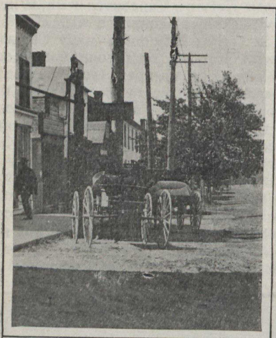
A Touch of Old Oakville. Glimpse of part of the main street as it used to be.