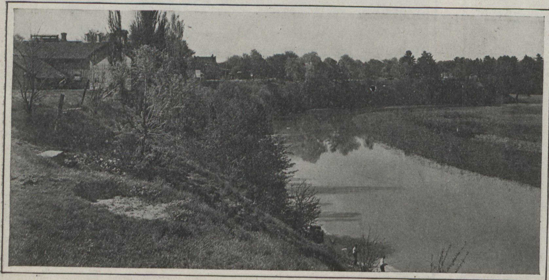
Sixteen-Mile River gives Oakville almost a classic background.