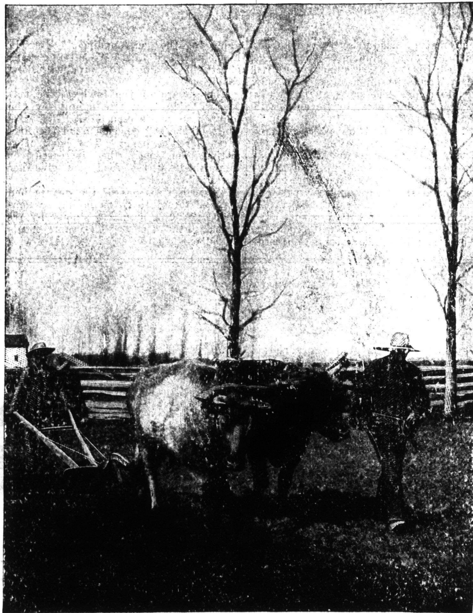
Go where you like, it's all got to be plowed.

Then there are the little one-day excursions so popular in all sections, that are patronized by many country ladies and should be by many more. These little trips give glimpses of new country and yet allow time for the morning and evening chores, so necessary on every farm. They may be to some lake or summer resort, to some large city or some attractive spot near or far from home, but wherever they are they fur-