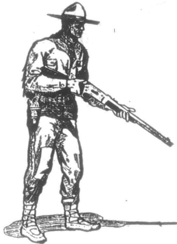
A NARROW ESCAPE.

Coming down to the pistol and revolver, there are so many dangerous ways of handling them that one is disposed to doubt if there is any way of safety. A loaded revolver is a rattlesnake always ready to strike. One iron-clad rule, never to be broken, never forgotten for an instant, must suffice. Never permit a revolver, loaded or un-