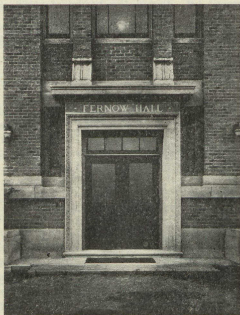
Entrance to the Forestry Building Cornell University