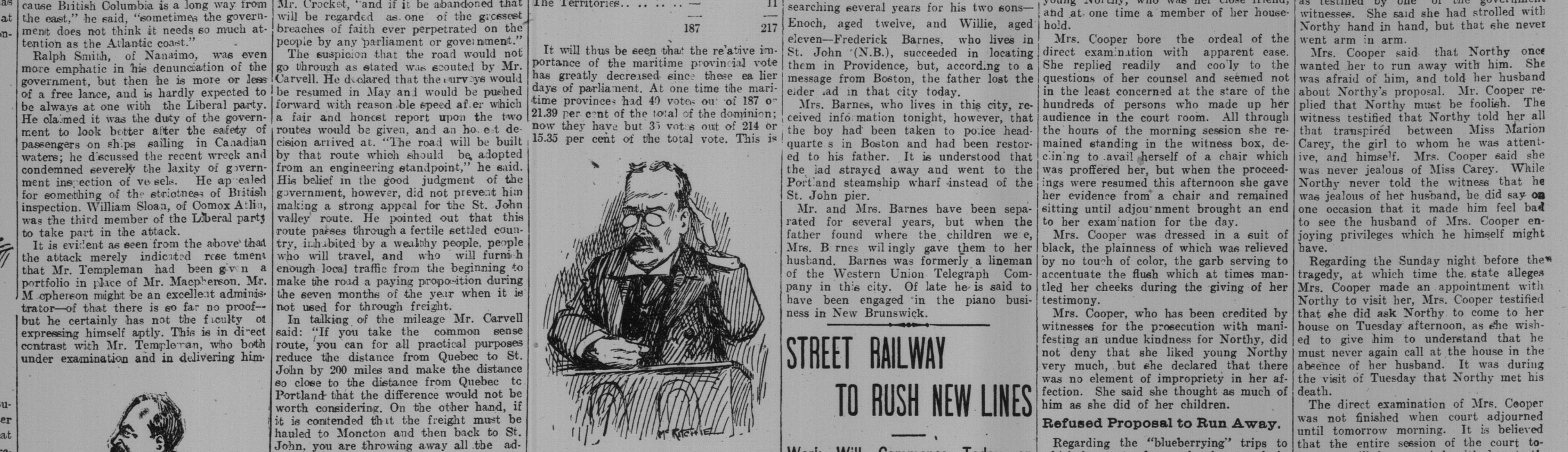
a Question from the Other Side of the House.

the large decrease of 6 per cent, and at