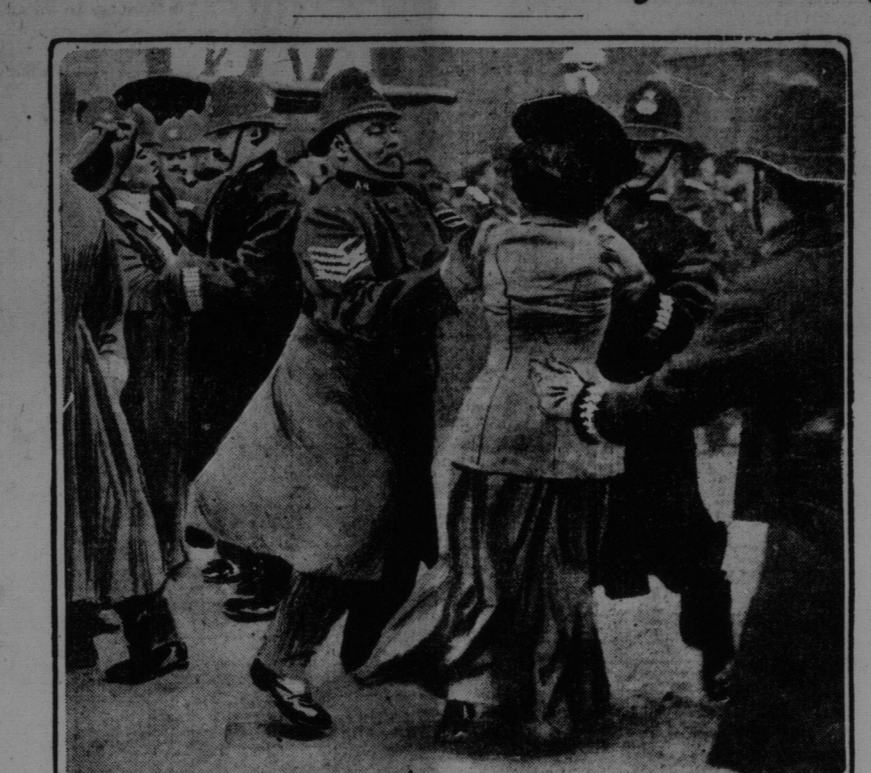
MILITANT SUFFRAGETTES IN ACTION, SHOWING HOW IT TOOK THREE POLICEMEN TO HANDLE ONE OF THEM.