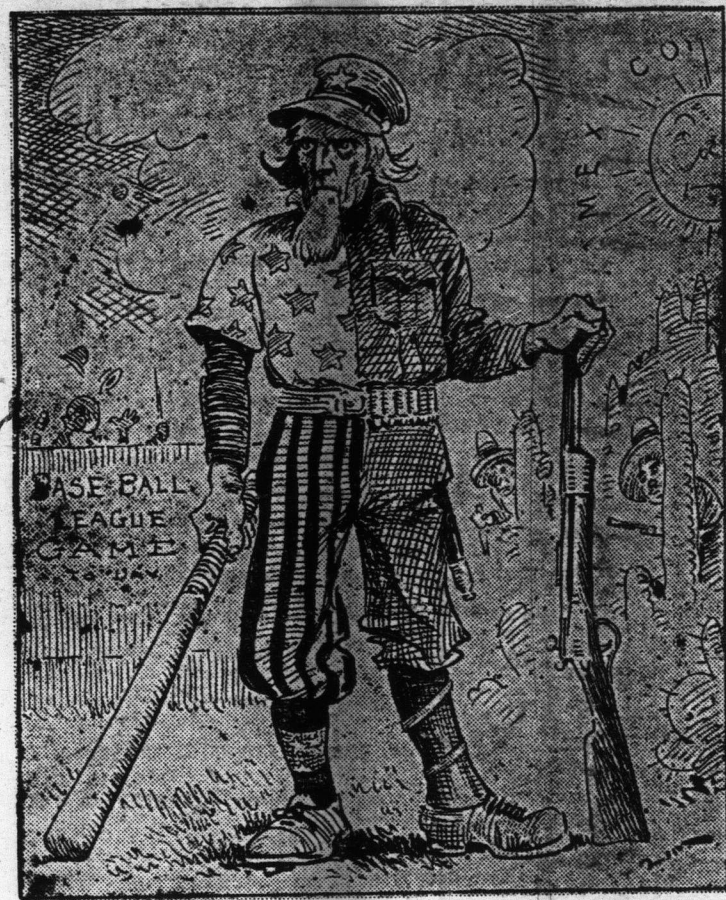
BETWEEN LOVE AND DUTY.