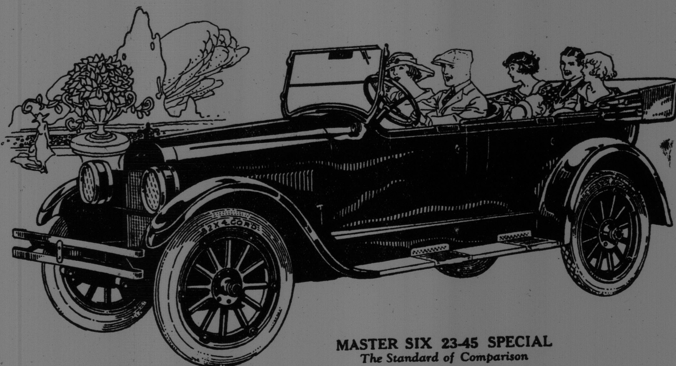
MASTER SIX 23-45 SPECIAL The Standard of Comparison

All Prices F.O.B. Oshawa —Government Tax Extra