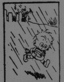
THE WEATHER. Showers. Clearing towards night. Sunday fair and cool.