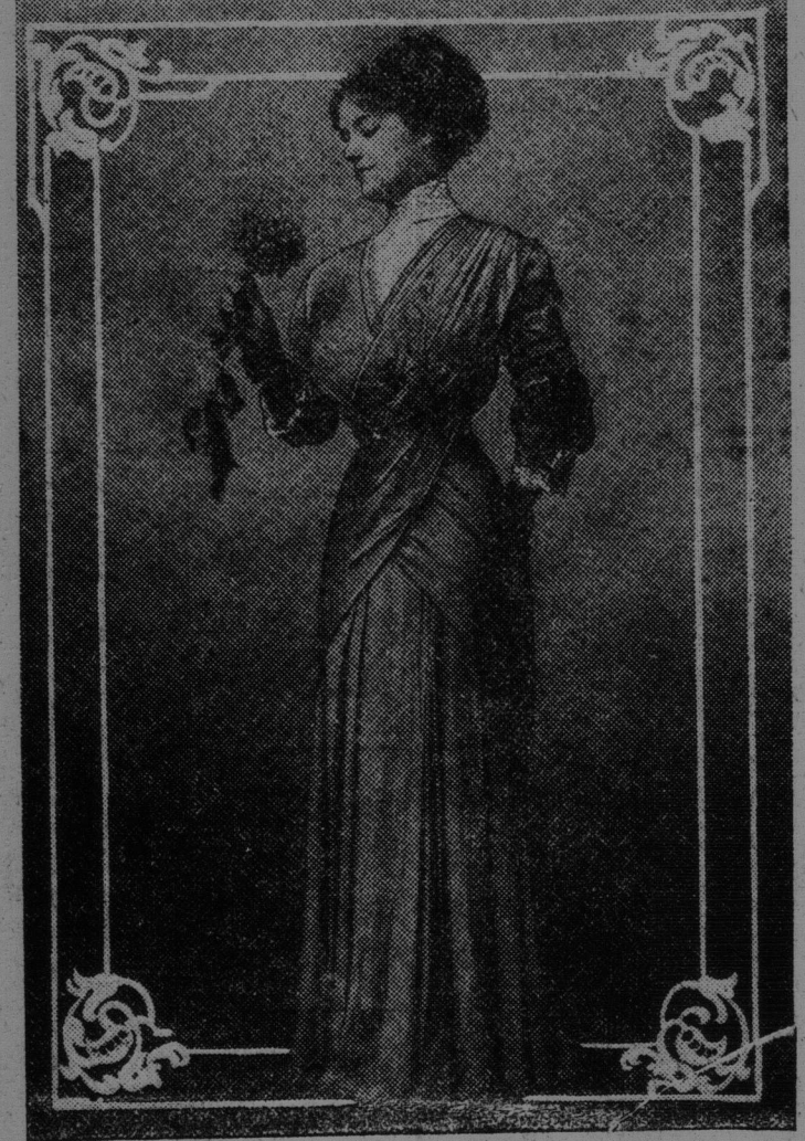
A POLONAISE DRAPED FROM THE SHOULDERS

This dainty afternoon frock offers a crosses in surplice tashion over the bust, suggestion to the woman who wishes to remodel a last year's costume. The polonaise of crepe de chine has been sufficiently a heavy silk tassel. The turned back rever, embroidered in shades of the color application of the color application. Most people do not realize the alarming